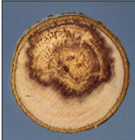
Decay in laurel oak and waxmyrtle caused by Inonotus rickii