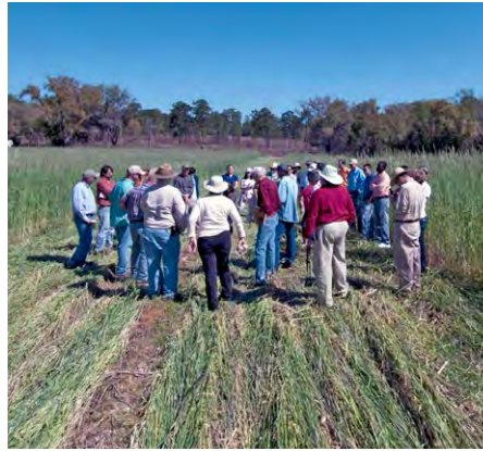
Fulford Family Farm

The cover crop is terminated prior to planting with a roller-chopper combined with an herbicide spray boom. The results of using cover crops on both farms are reduced erosion, increased water infiltration, decreased