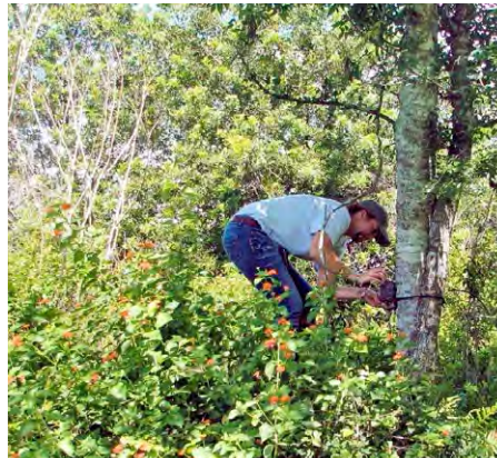
Setting a remote camera on a private property adjacent to the Caloosahatchee River.

the Florida Fish and Wildlife Conservation Commission (FWC), works with landowners north of the Caloosahatchee River with a focus on panthers. Dr. Korn conducts public outreach, works with private landowners to develop new incentive programs, and monitors the presence of panthers in the expansion area north of the Caloosahatchee River through remote cameras.