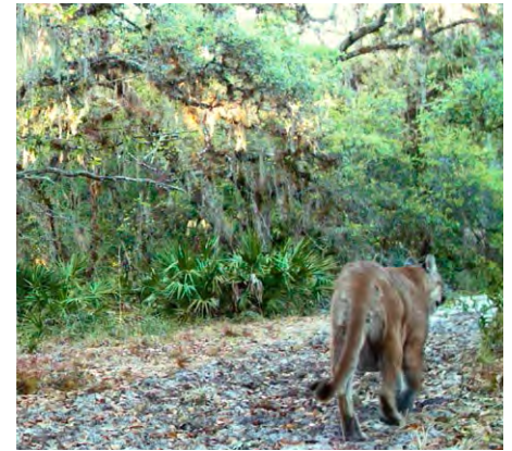
A male panther walks by a remote camera on Platt Branch WEA, Highlands County.

Since January 2014, 15 remote cameras have been placed on public and private lands in Glades, Highlands, Charlotte, Sarasota, and Polk counties, with future sites planned in additional counties. Remote cameras are a valuable non-invasive tool for monitoring the presence of panthers, especially in areas outside of the known breeding population. Information from the cameras will help FWC biologists better assess panther numbers, identify areas of use, and hopefully verify the presence of females and if breeding (i.e. kittens) occurs north of the Caloosahatchee River. Additionally, conducting the camera survey on both public and private lands builds strong relationships between agencies and private landowners.