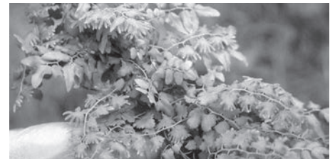
Above: Old World Climbing Fern.

Early detection is critical. Once Lygodium is established, it is very difficult to remove. Herbicides are the best option. To treat, cut the vine about a foot above the ground and spray the entire