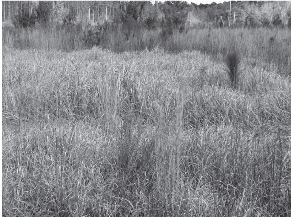
Cogongrass infestation.

The plan was to burn the site in late 2006 or early 2007, but an experienced burner that would do the work in that time frame could not be located. Bareroot slash pine seedlings to replant the site had been ordered in early 2006, so I was committed to plant by the end of March 2007. It was decided