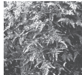
Left: Japanese Climbing Fern.

lower section of the plant with triclopyr, glyphosate, imazapyr or metsulfuron methyl herbicide products. Garlon, Round-Up, Arsenal and Escort are examples, respectively, but generic brands of some of these are available. As always, use these chemicals according to the label and wear protective gear. When the vine is cut, don't try to remove any of the plant, leave it where it is or you'll risk spreading the spores.